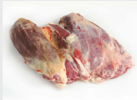
1. Position of the hind shin.